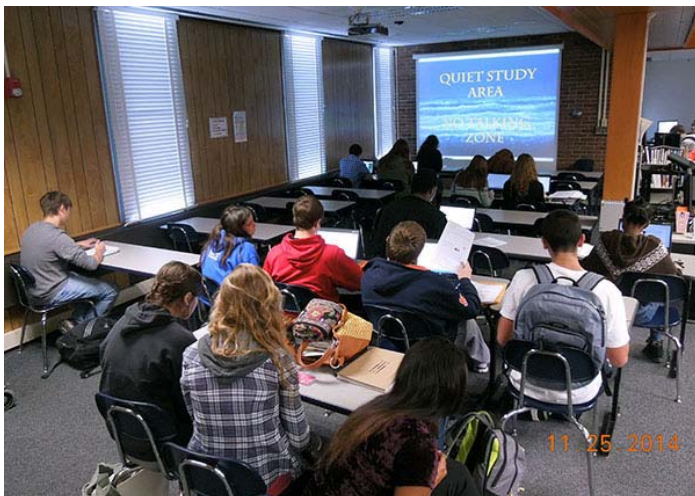
The "Ocean" continues to be a popular study area with the sound of the waves as white noise from ceiling speakers during Activity periods